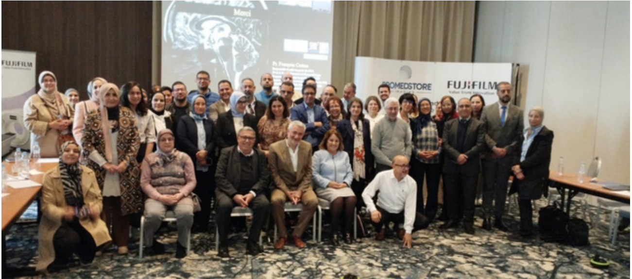
Group photo of the speakers and participants at the close of the workshop.

This event reflects the IUOIR's commitment to supporting continuing education for radiologists across the French-speaking world and strengthening ties between European and African medical teams .