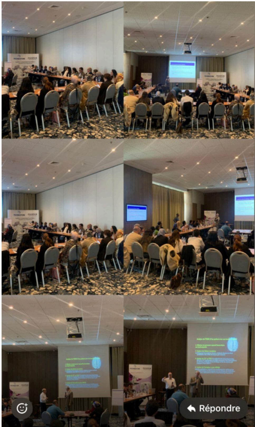
Highlights from the twelve clinical neuroradiology topics covered throughout the day.